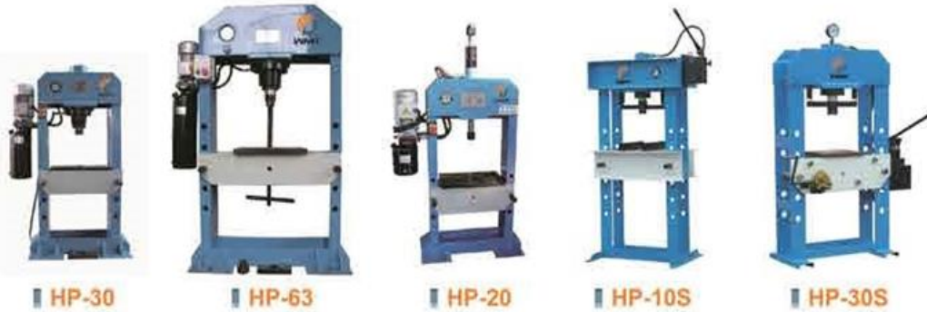
Hydraulic press HIDRAVLIČNE STISKALNICE HIDRAULIČNE PRESE