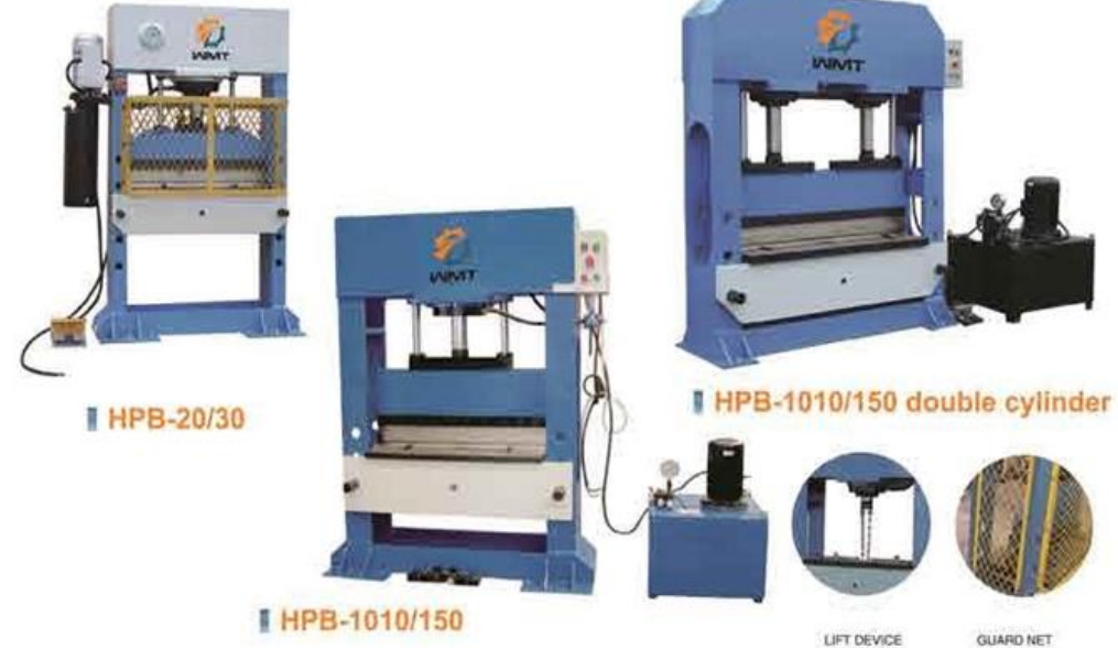
Hydraulic bending machine HIDRAVLIČNE STISKALNICE za KRIVLJENJE HIDRAULIČNE PRESE ZA SAVIJANJE